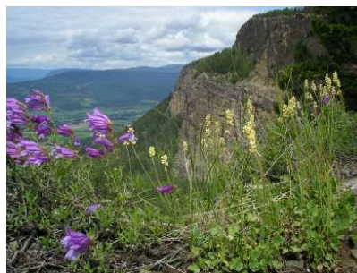
Enderby cliffs in the spring